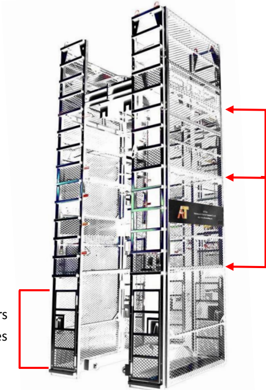
Access doors on both sides