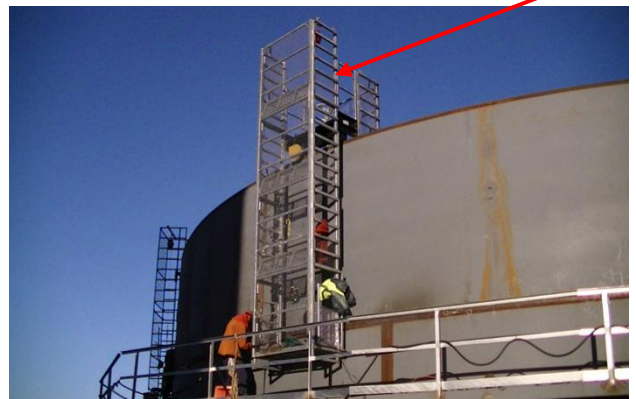
Manual chain drive on both sides allows a single operator to move the unit into place. The drive wheels swivel to allow for easier travel on various tank diameters.